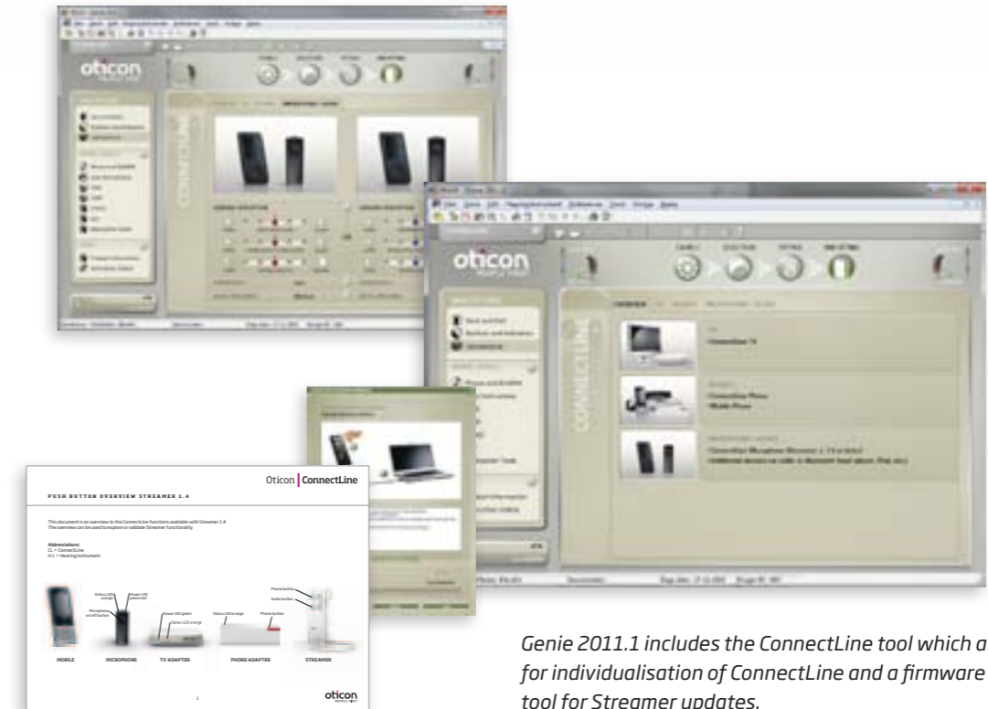
Genie 2011.1 includes the ConnectLine tool which allows for individualisation of ConnectLine and a firmware update tool for Streamer updates.

- individualise and upgrade through Genie 2011.1